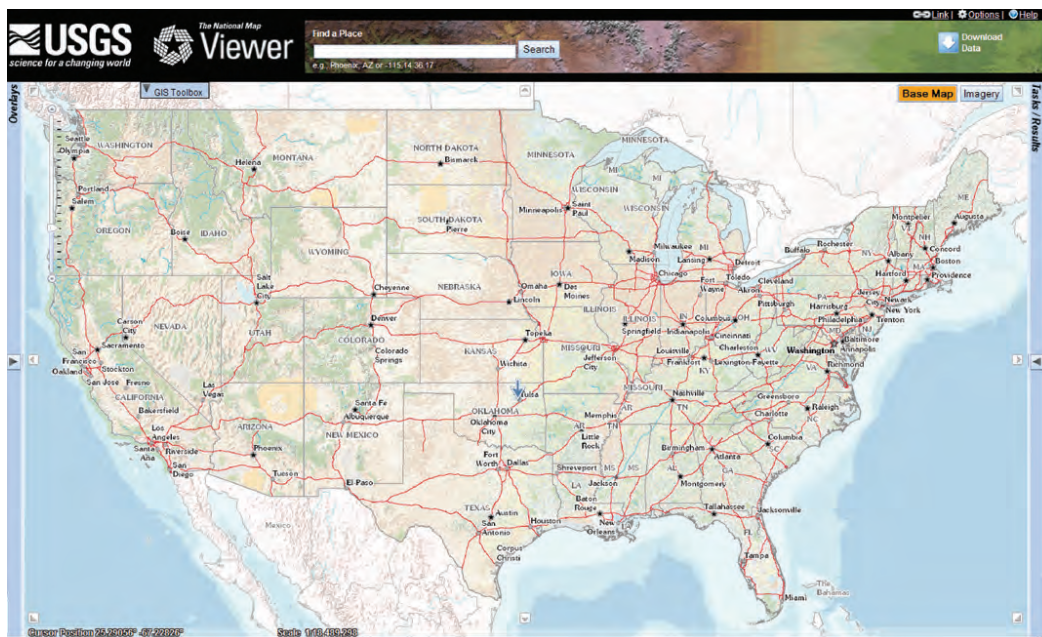
Figure 3. Screen capture from The National Map Viewer .