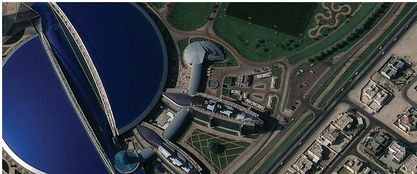
Khalifa Sports City, Doha, Qatar .50-meter resolution, pan-sharpened