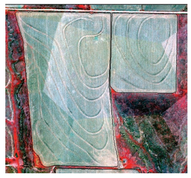
Figure 1. April 13, 2000, image for fields in northwest Kansas*. This false color composite was created using spectral bands 4 (NIR), 3 (red), 2 (green) and assigned to the red, green and blue color areas of the computer monitor.